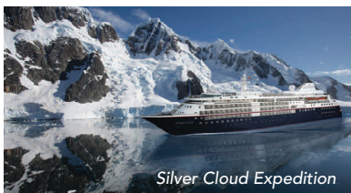
Silver Cloud Expedition